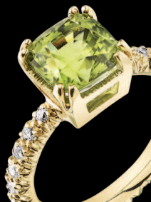
Gemstone Rings with Diamonds