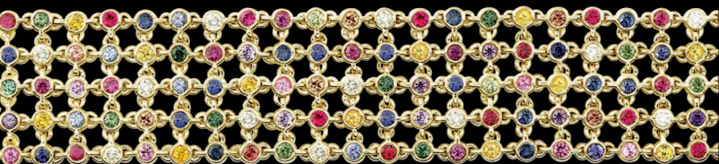
Celebration 5-Row Bracelet