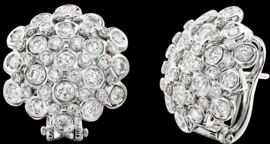
Seasons Diamond Ear Clips