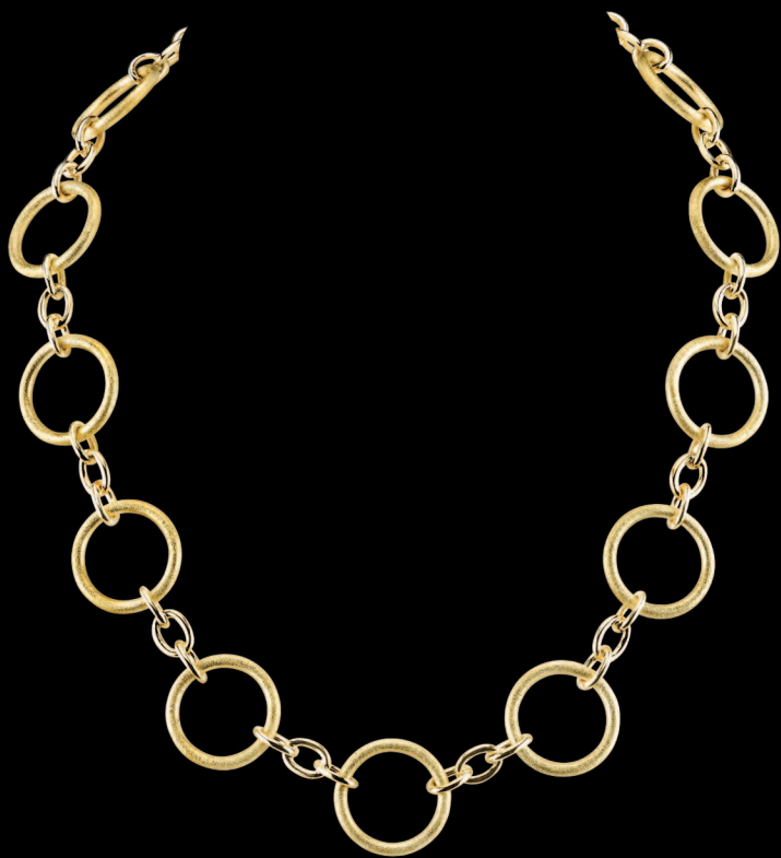
Gold Embrace Necklace