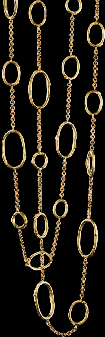
Olive Branch Chain