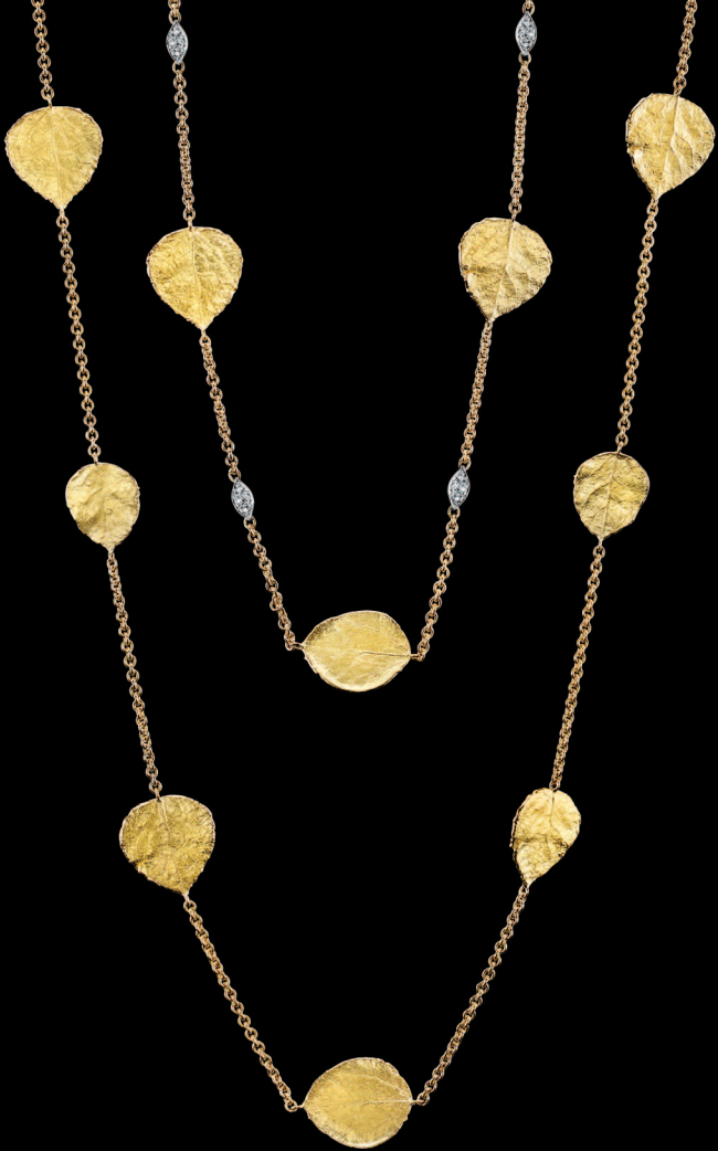
Aspen Leaf Chain Necklaces