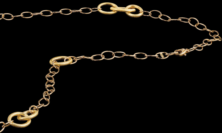
Long Embrace Chain Necklace