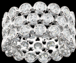
Ring and Earrings from Seasons Collection