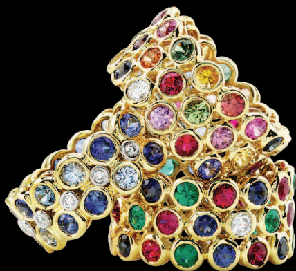
Ruby, Sapphire, Emerald & Diamond Bands Seasons Collection