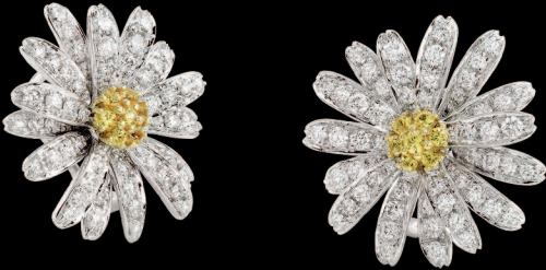
Diamond Daisy Ear Clips