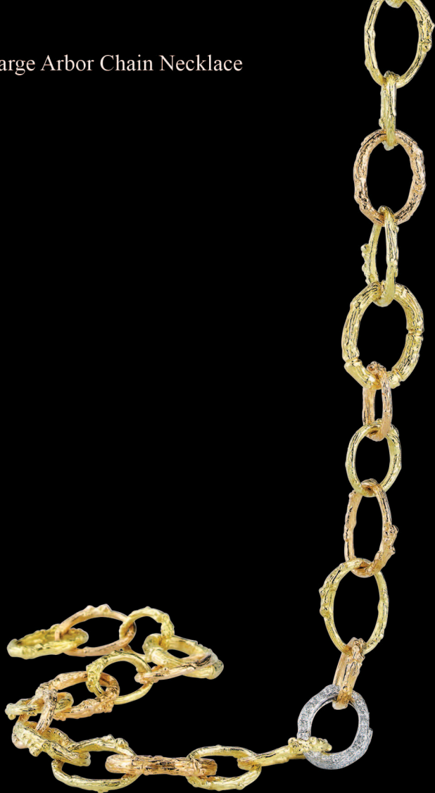
Large Arbor Chain Necklace