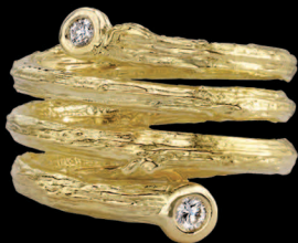
Olive Branch Coil Rings