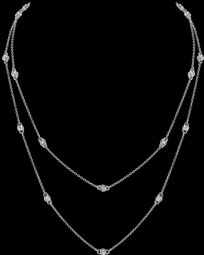
Diamond Celebration Necklace