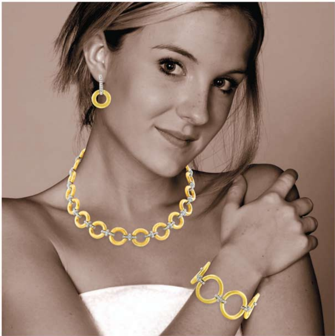
Gold and Diamonds Circles and Sparkle