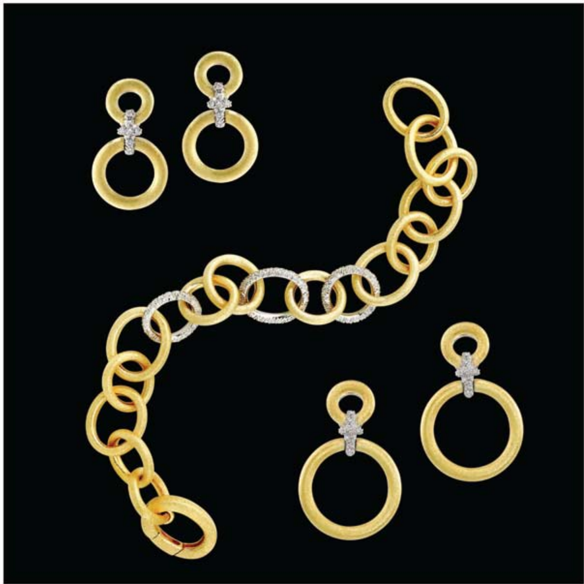
Gold Earrings and Chain with an 'Aspen' Finish