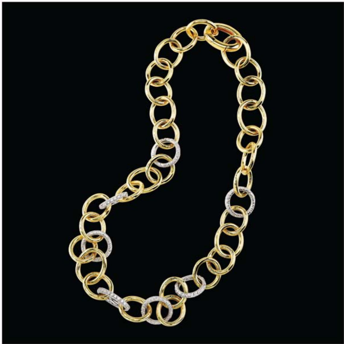
Handmade Diamond and Gold Chain