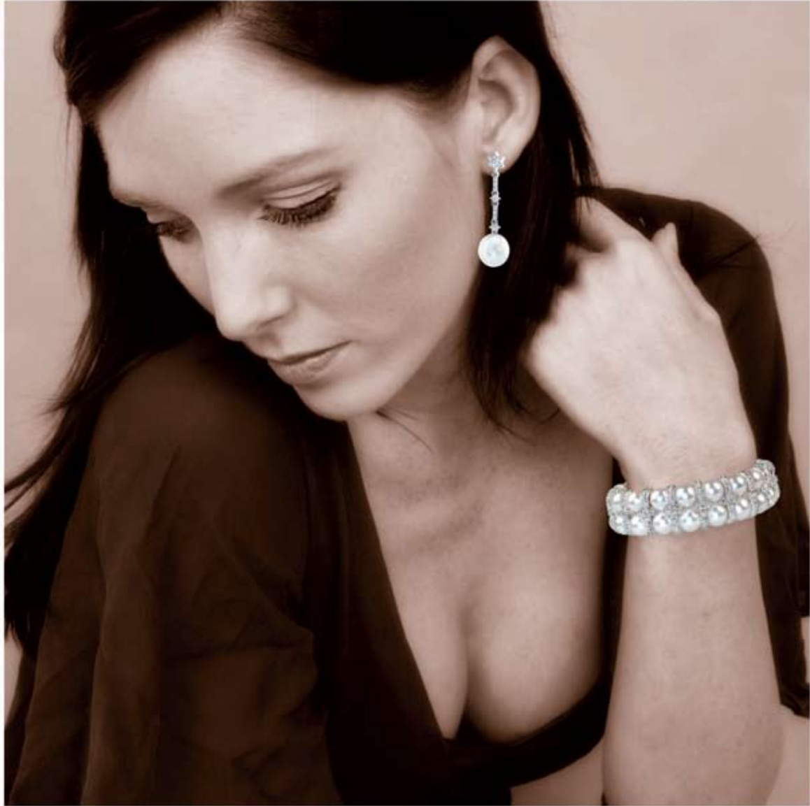
Pearl Drops and Two Row Diamond and Cultured Pearl 'Floating' Bracelet