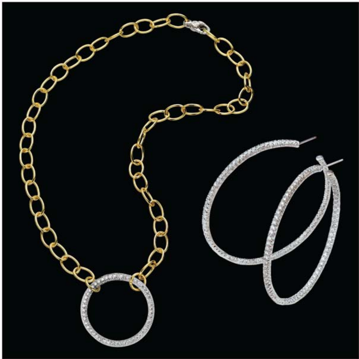
Large Bright-cut Diamond Hoops and Circle on Handmade Chain