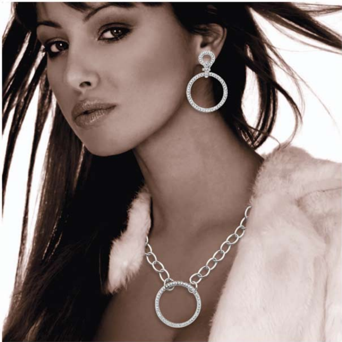
Stunning Diamond Earrings and Circle on Handmade Chain