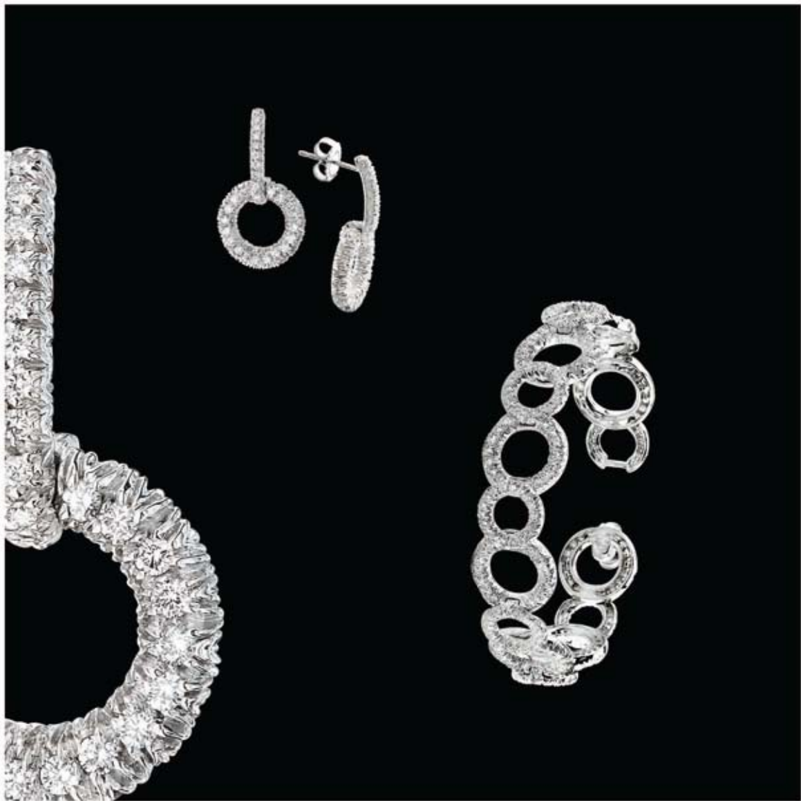
Bright-cut Diamond circles dangling from an ear or draping a wrist