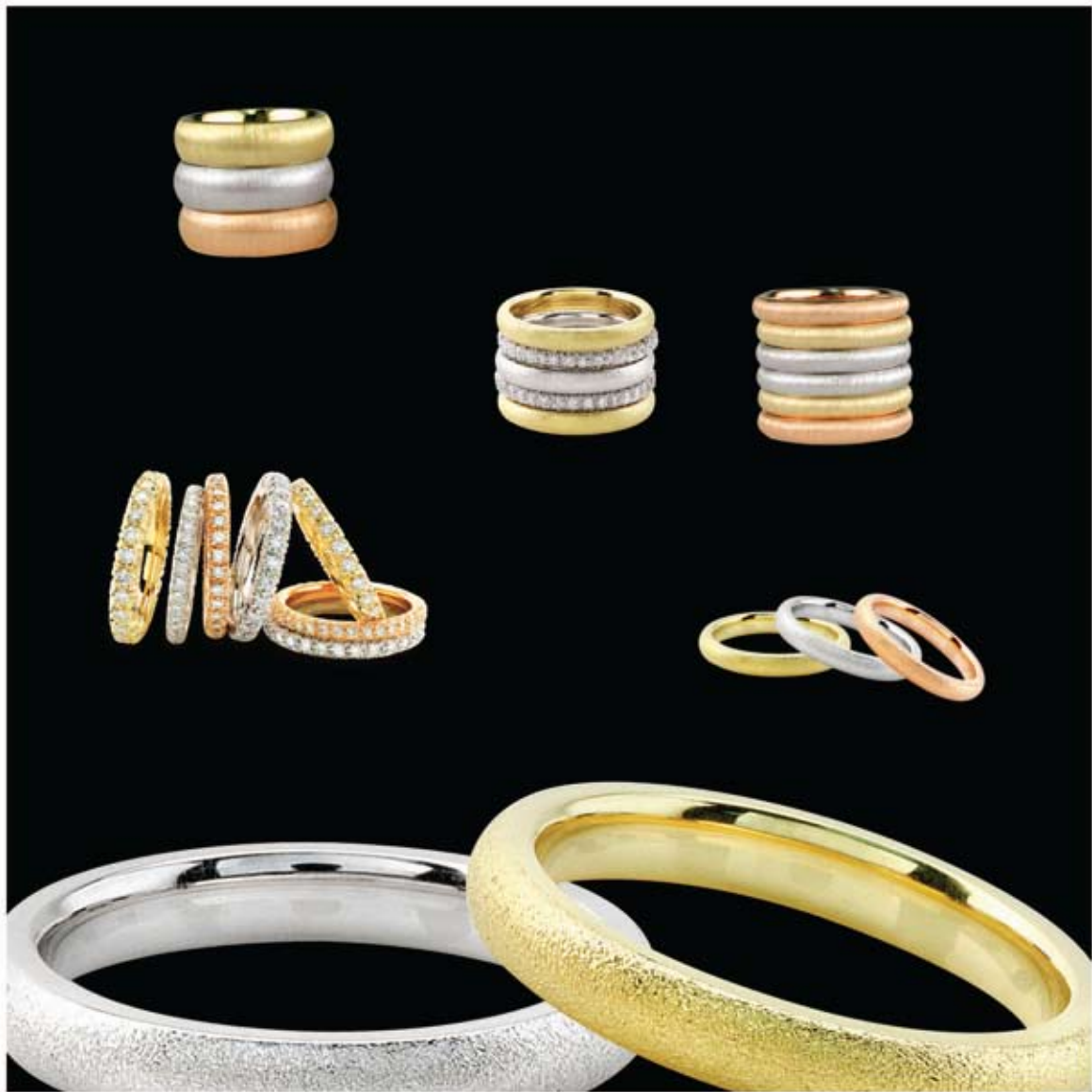
Embrace Rings; Wide or Thin with 'Aspen' or 'Savannah' Finish