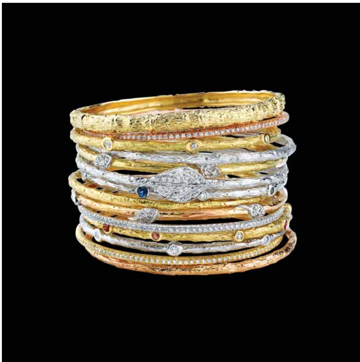
Stacking Bangle Bracelets