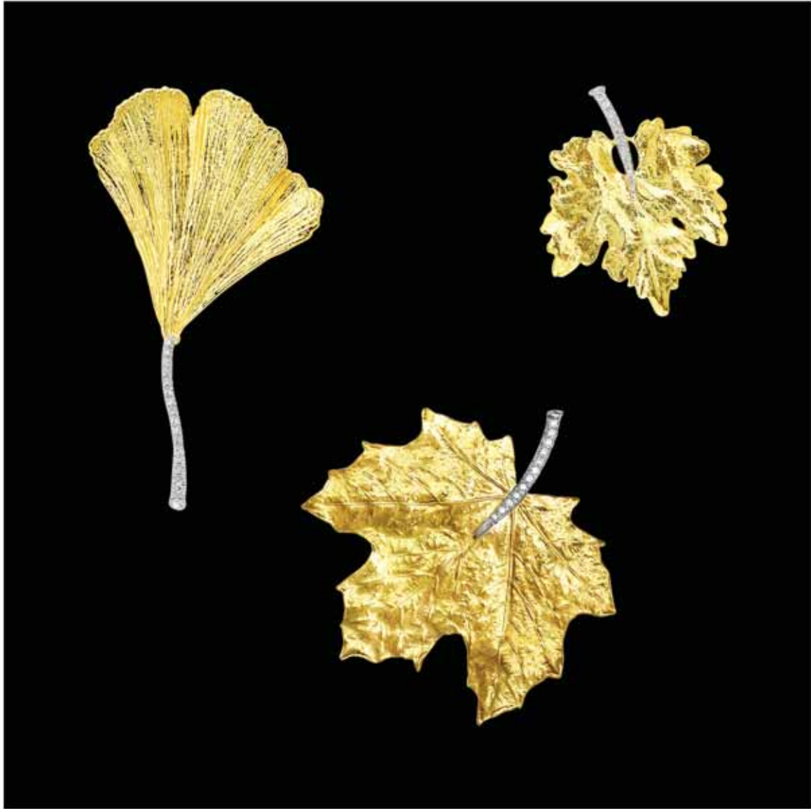
Ginkgo, Merlot and Maple leaf brooches