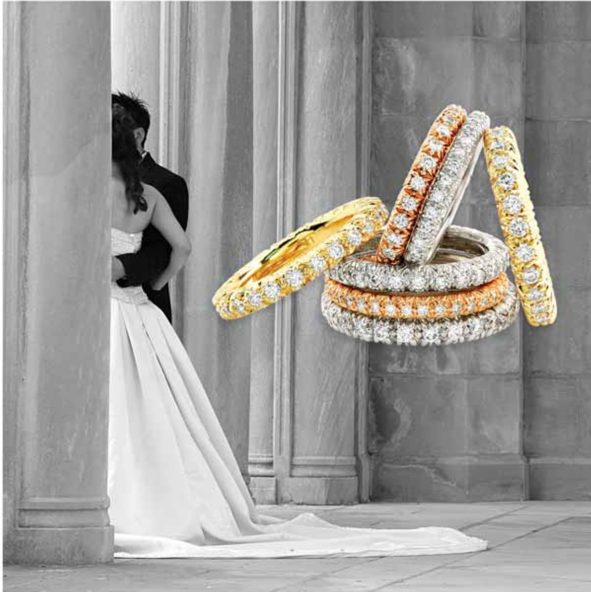
Arbor wedding bands available in four diamond sizes