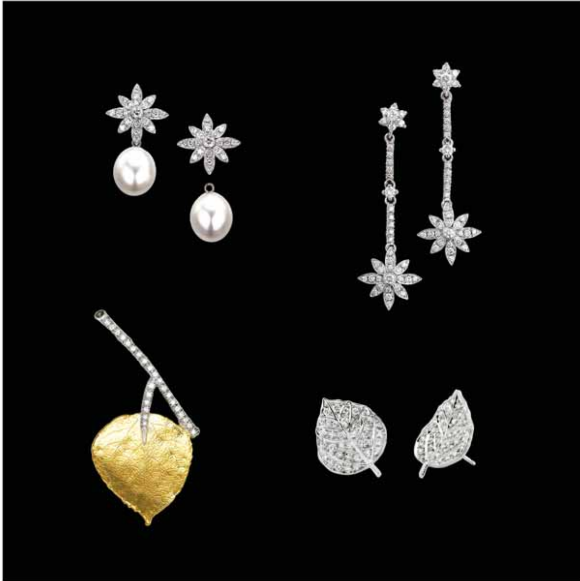
Snowflakes and Aspen Leaves