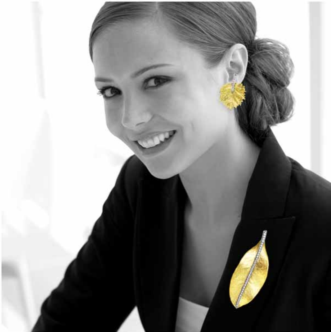
Poplar earrings matched with a Magnolia Brooch