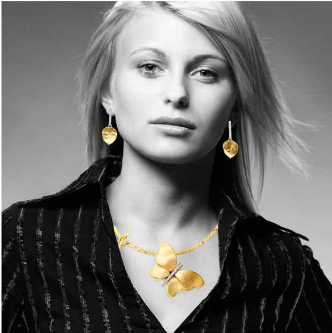
Branch link necklace