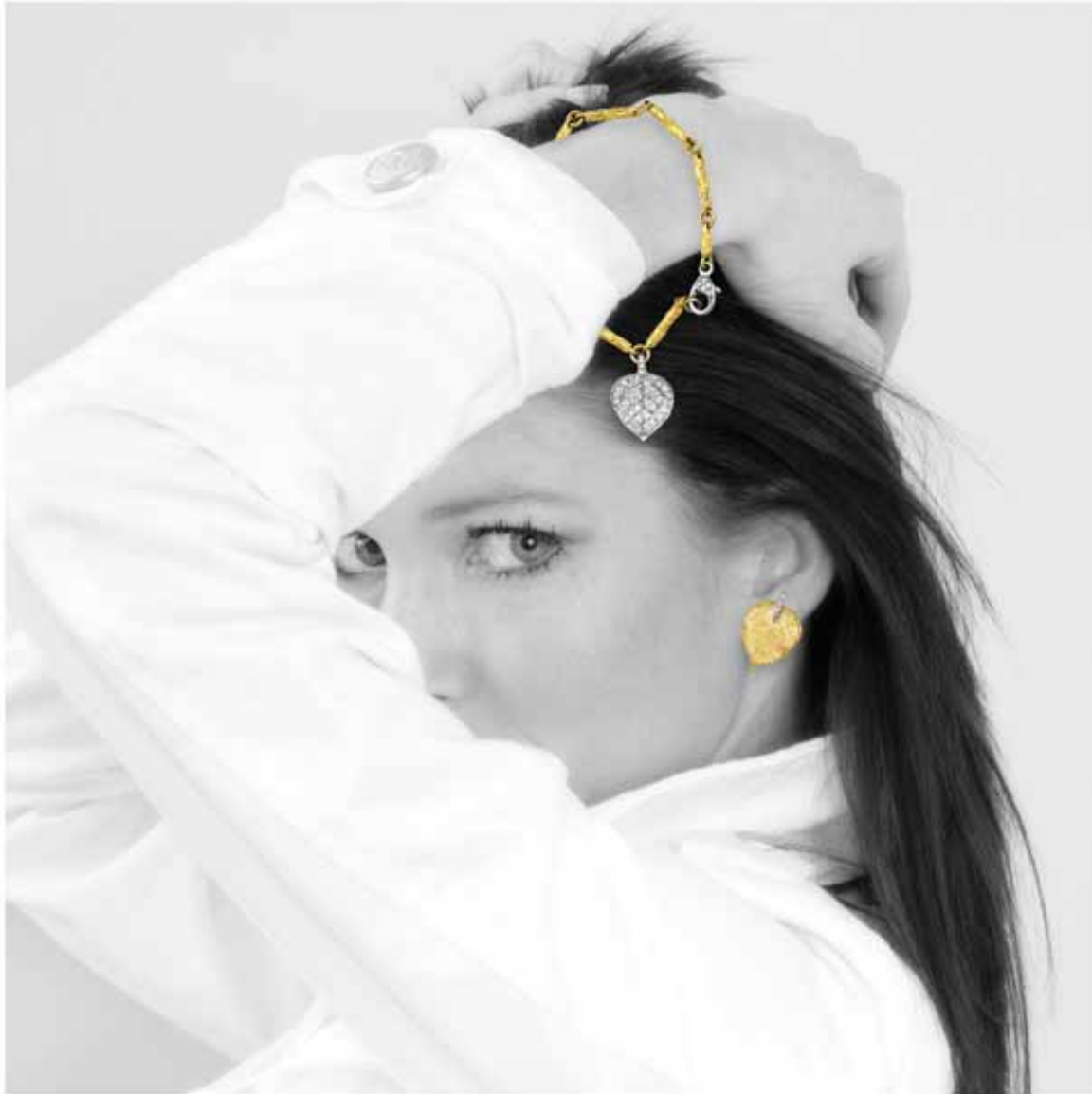
The branch charm bracelets