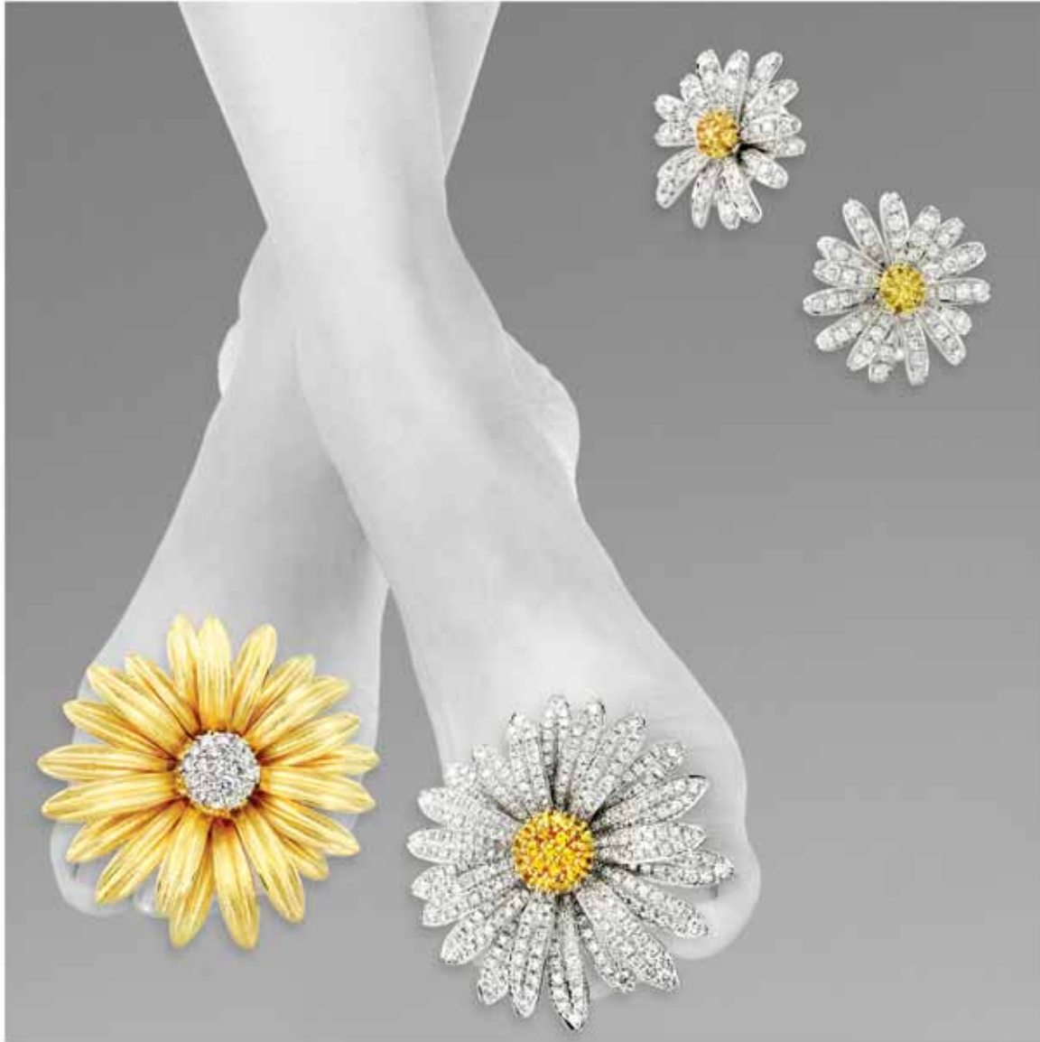
Daisy pins, pendants earclips and brooches