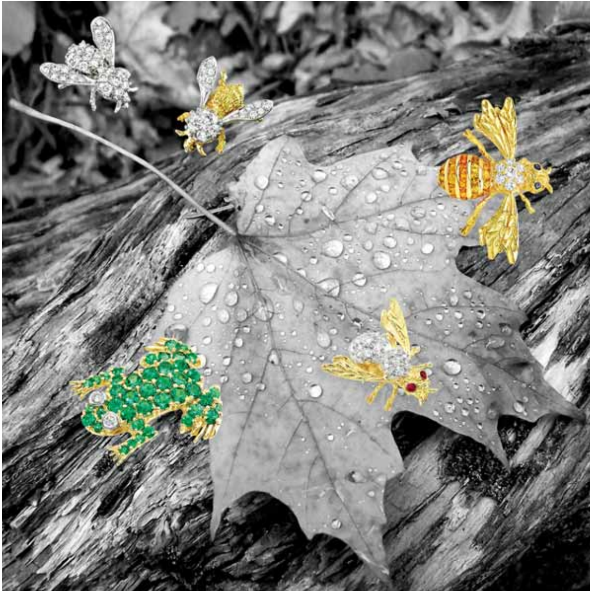
Bees and frogs to pair with your Brooches