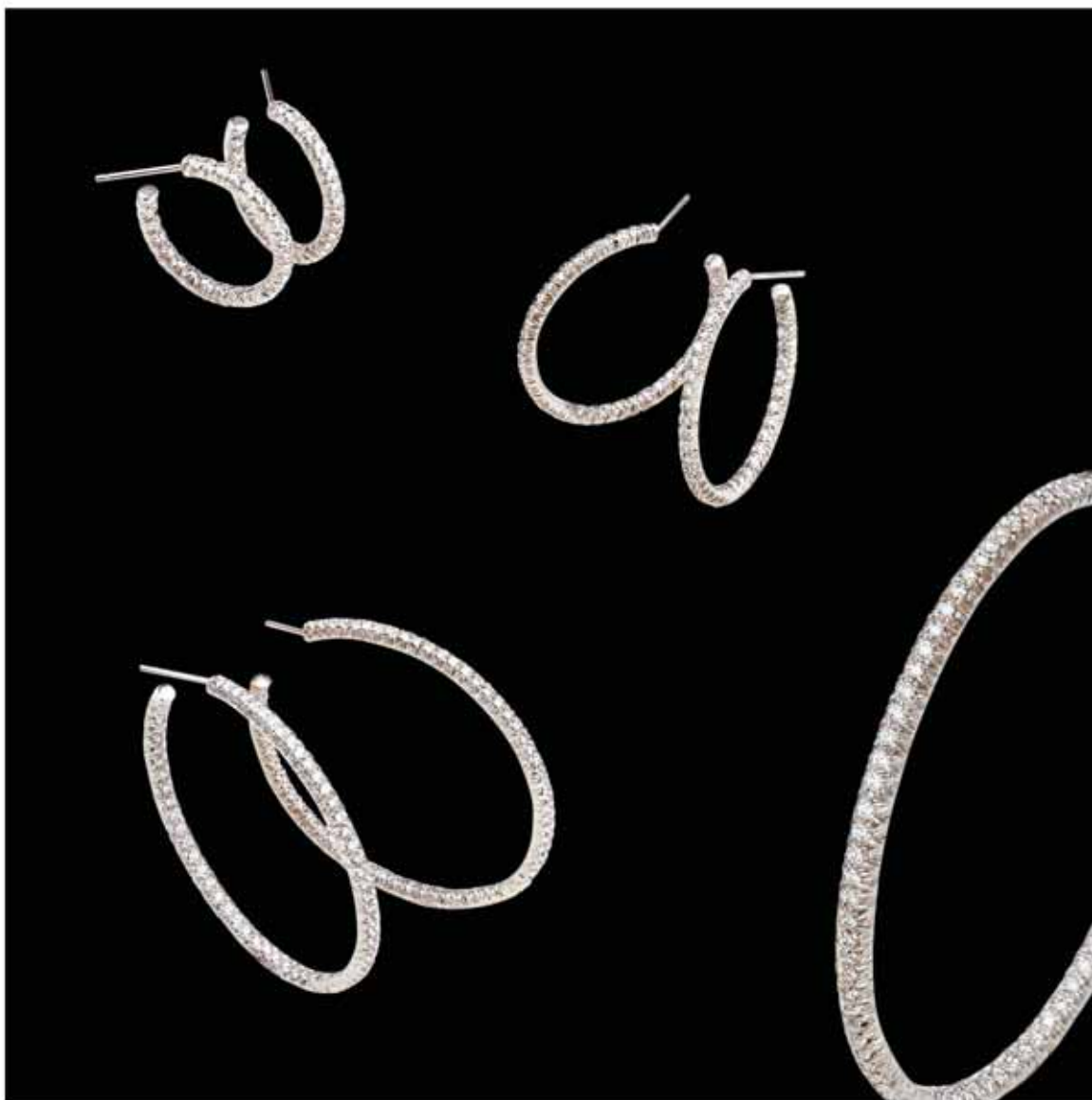
Diamonds hoops from 1/2" to 2 1/2" in diameter