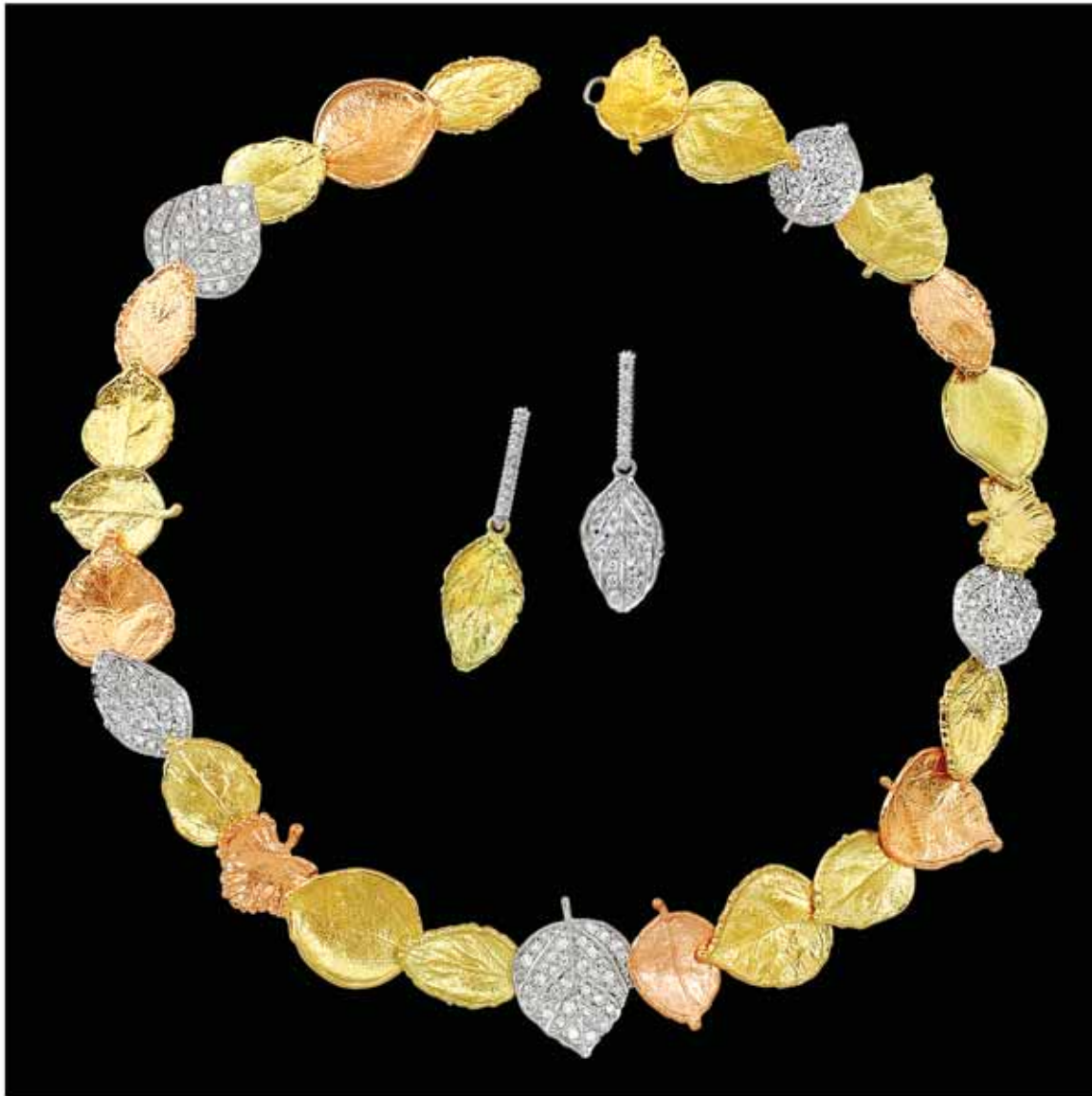
Aspen and Brier leaf necklaces and earrings in four colors of gold, with or without diamonds